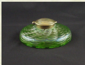
Loetz type inkwell

Using a Microsoft application such as Publisher allows the creator to select from a variety of templates. This particular template is named Vintage