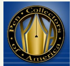
Pen Collectors of America Logo

find pens an interesting addition to their realm of collecting. The alternative is to stay a small, tight-knit organization and continue to look for ways to grow our membership. One thing for sure is if we do not hang together then we will surely fold.