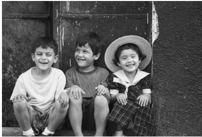
Are they happy for inkwells?